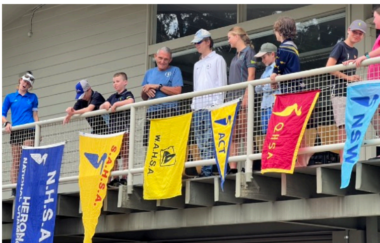
Unfurling the state and national flags at the opening ceremony