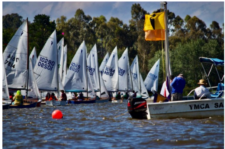
Ready at the start line at the 63rd Heron Nationals