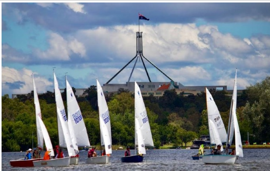
Lake Burley Griffin at the 63rd National Championships

Welcome to another edition of the Heron newsletter, which will be the last one before the sailing season ends with a crescendo (i.e. the Qld State Titles on Lake Cootharaba).