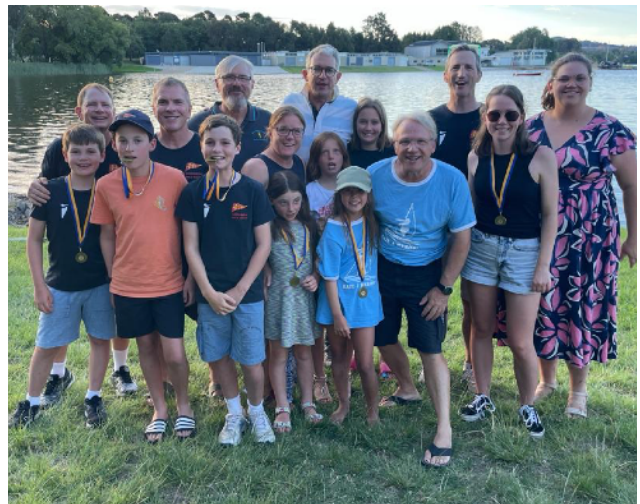
Narrabeeners at the Nationals