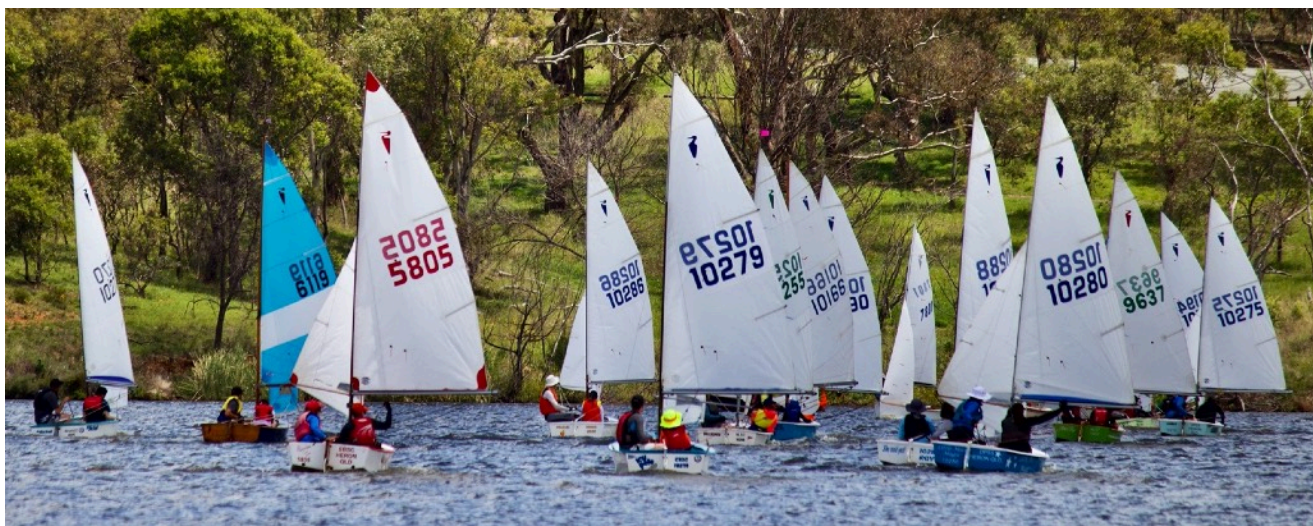
Lake Burley Griffin at the 63rd National Championships