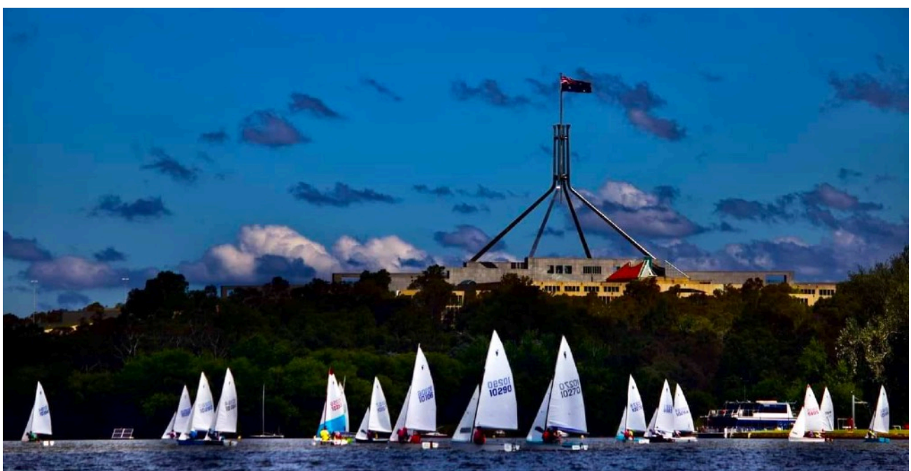
Spectacular views of Parliament House at the 63rd Heron Nationals